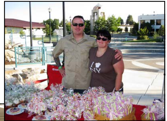
Let Them Eat Cake...Bakery supplied the goodies for our sweet tooth.