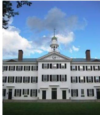
Dartmouth College, founded in 1769

I also experienced an authentic New England Clambake, walked the historic campus of Dartmouth and enjoyed the hospitality of Hanover.