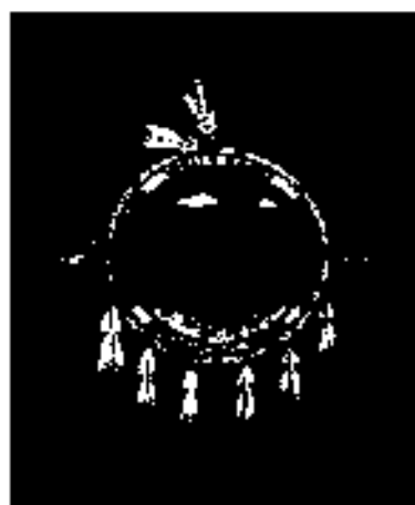
Wells Band Shield Designed By © Bruce Stevens 2002