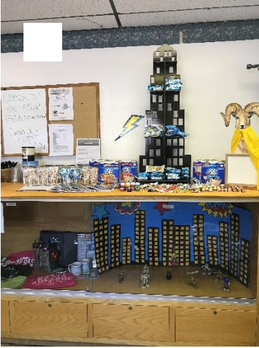
Superhero Decorations in Battle Mountain.

The Battle Mountain Center started off the Fall semester by decorating with a Superhero theme. There were snacks galore set out for the students to enjoy. The bi-annual event, Welcome Back Backpacks, had three winners. Included in the