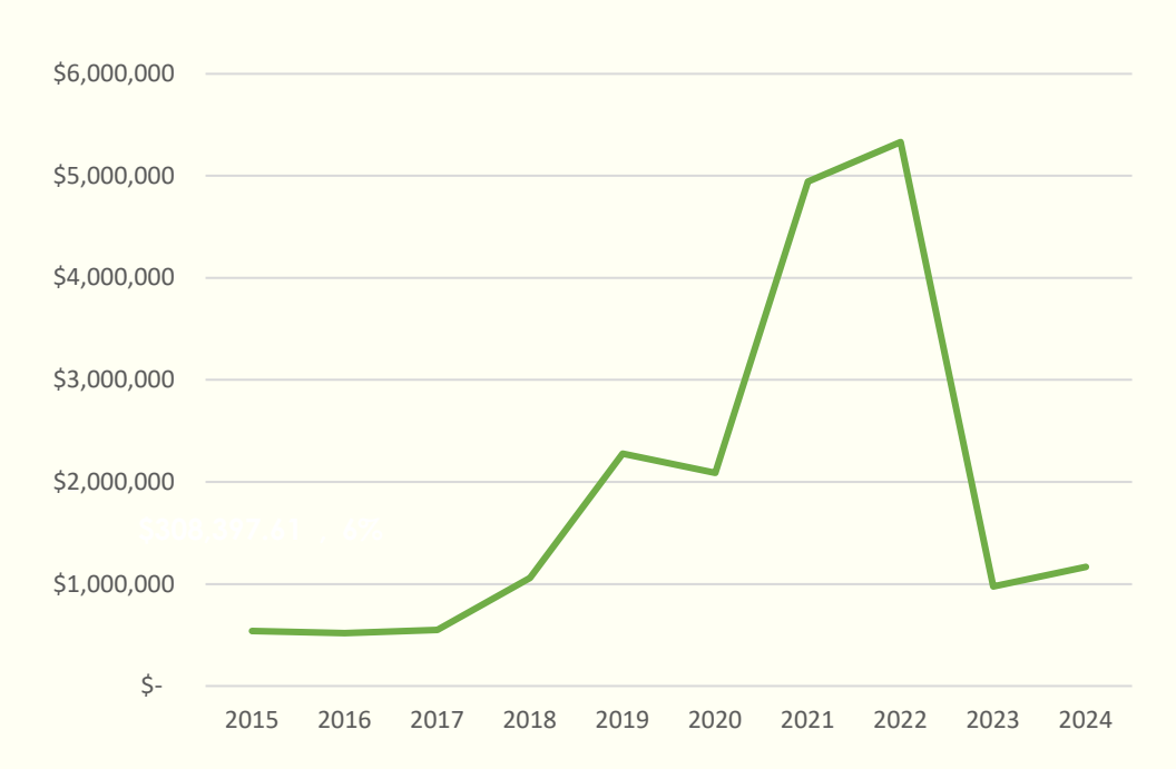
GBCF 10 Year Giving History

Northeastern Nevada Regional Hospital (NNRH) has committed to funding $5,000 in scholarships for students pursuing an Associate of Science in Radiologic Sciences through the Great Basin College Radiology Program. NNRH Radiology Scholarships will be awarded to five students per year.