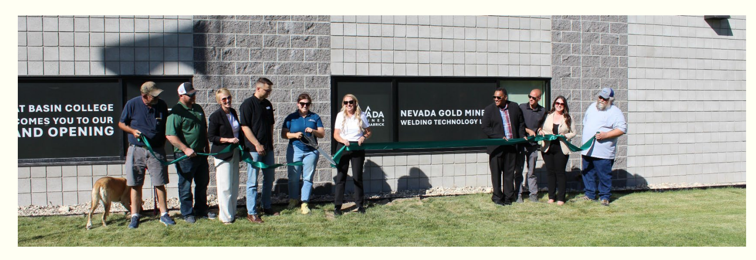
Ribbon Cutting for the new Nevada Gold Mines Welding Technology Lab.