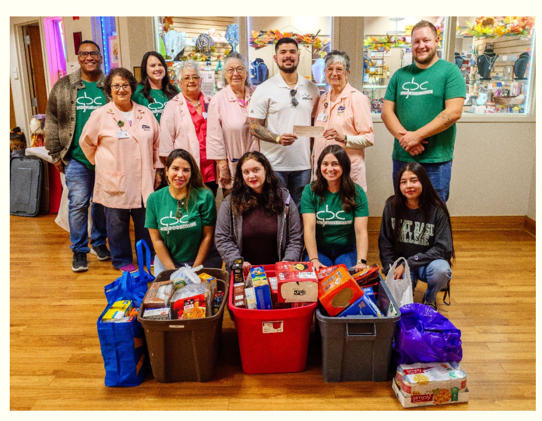
The GBC Foundation partners with SGA and community partners support food pantries on all GBC campuses. Foundation and SGA representatives pick up food items donated by the Northeastern Nevada Hospital (NNRH) Auxiliary.