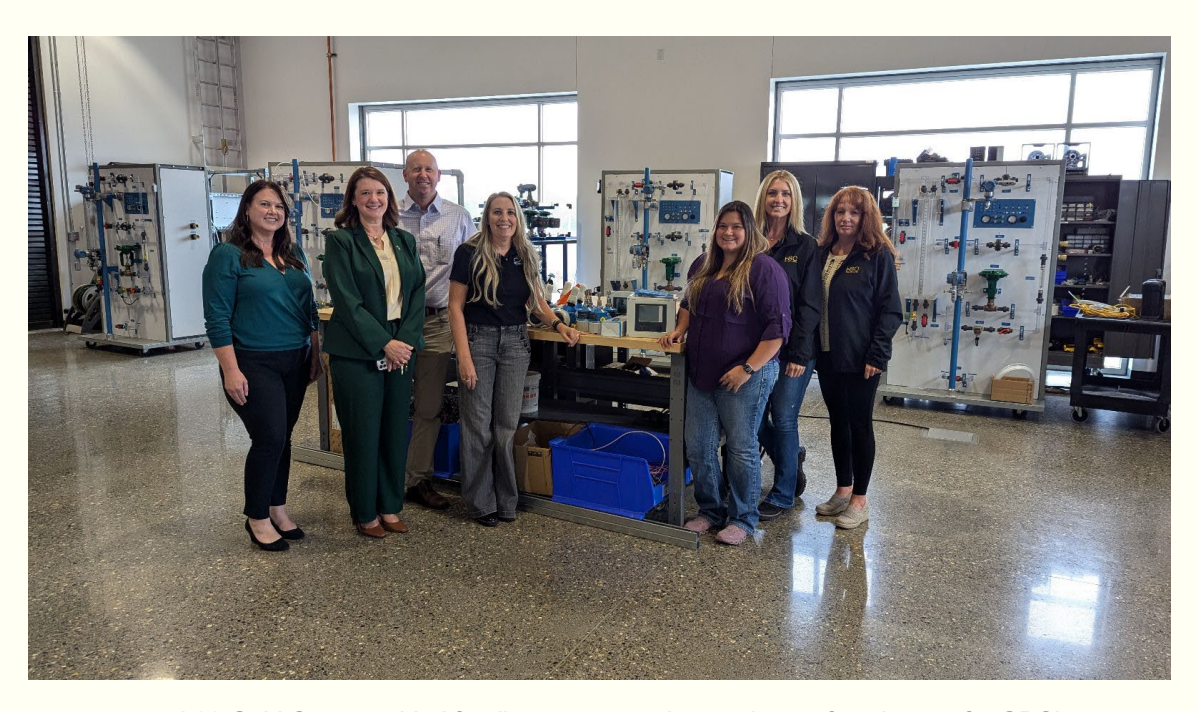
i-80 Gold Corp provided funding to support the purchase of equipment for GBC's Instrumentation Lab in Winnemucca.