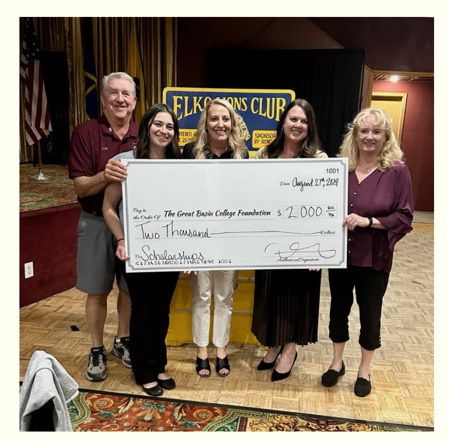
The Elko Lions Club supports student success through their longstanding scholarship.